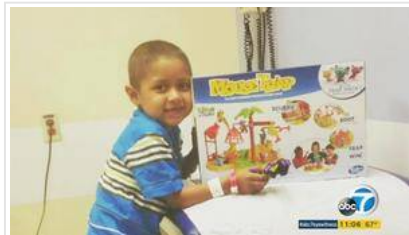
Toys donated in honor of Azusa boy who died of cancer stolen