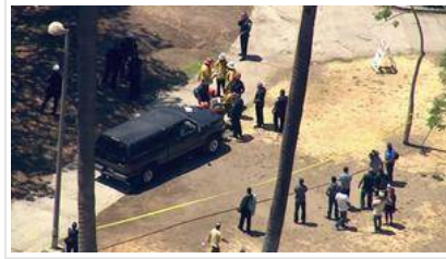
4 injured, 2 critically, by truck in MacArthur Park 'accident'