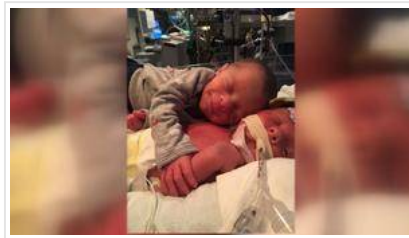
Thousands mourn death of one of the viral 'hugging twins'