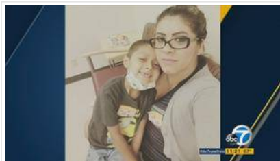
Public helps Azusa mom replace stolen toys for kids with cancer