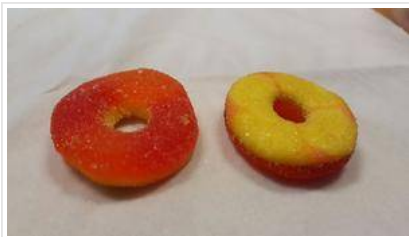
THC-laced candy sickened 19 at quinceanera in San Francisco, officials say