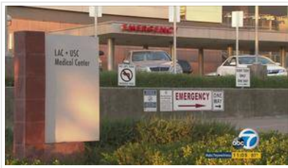
Information of 700 patients stolen from LAC+USC Medical Center