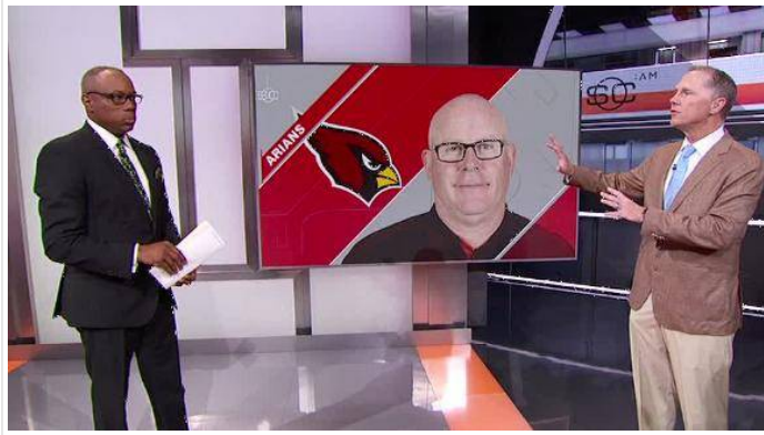
ESPN Cardinals coach Bruce Arians taken to hospital prior to practice