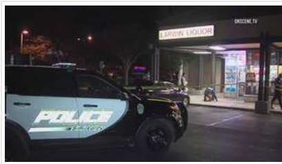
Man, 54, injured in stabbing after Simi Valley bar fight